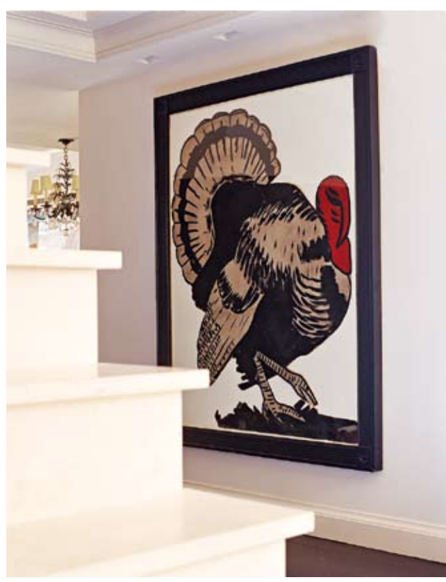
OPPOSITE: This travertine staircase with a custom bronze rail replaced an old "space hog" staircase in the entrance hall. The wall is a custom color by Donald Kaufman, highly lacquered. THIS PAGE: A 1900 sign from a Pennsylvania turkey farm is part of Cone's folk art collection.

Honestly, it just sort of evolves. I don't fuss over it. In the living room I started with an antique Chinese grain chest and over time I added the Acoma pottery from Mexico, the Grecian urn, and the Chinese woven-bamboo undergarment. This little tableau is finished—until I decide to change it. I'm not married to it. It's not set in cement. Who wants to live that way?